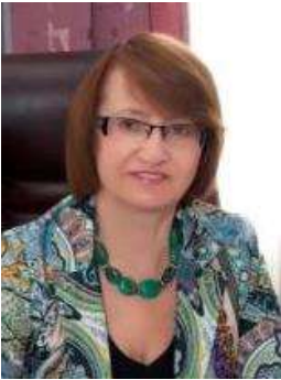
Professor, Principle, Samara State Institute of Culture, Samara, Russia